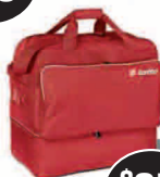
Team Pro Bag