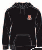
Score Hoodie -