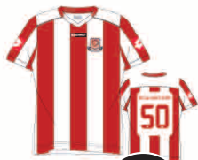
Prestige Shirt -