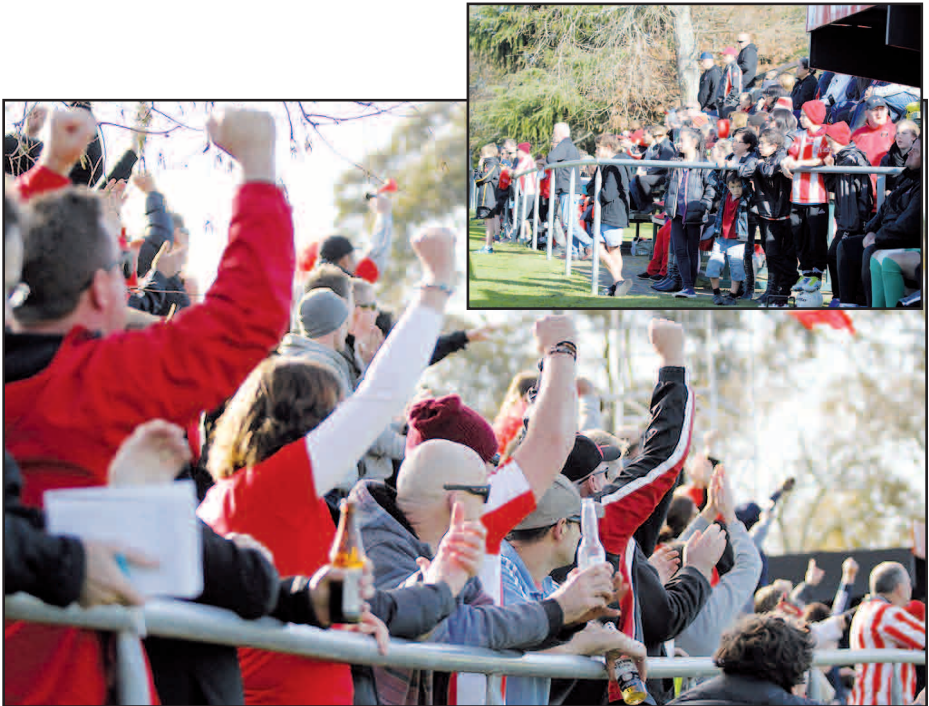
The Red and White army invade Melville