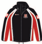
Hero Wind Jacket