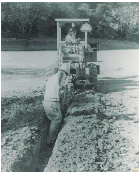
The drain digger in action.